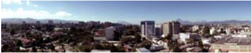
Urban panoramic of zona 10

Practice Session 13: Photography on location: panoramas of an urban landscape of skyscrapers in Zona 10 or VistaHermosa, especially from the hills looking down on VistaHermosa office buildings and tall apartments.