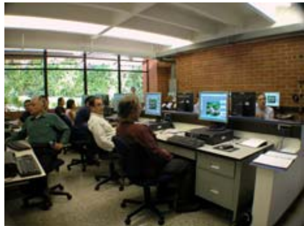
Different snapshots of the teaching lab for the courses of FLAAR at Universidad Francisco Marroquin.