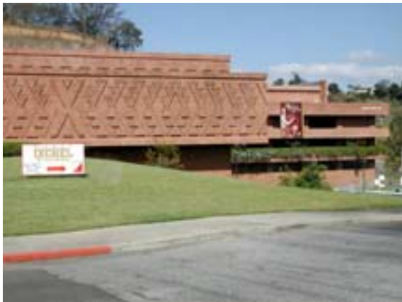
Museums Ixchel and Popol Vuh at UFM campus

Practice: Session 5: Introduction to computerized panorama cameras: the newest BetterLight digital pano system. Photography on location: panoramas of the UFM campus