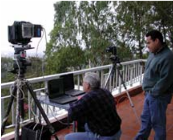
Installing panoramic equipment

Focus will be on visual communications of natural and urban landscapes.