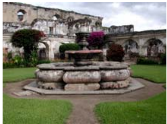
Santa Clara's fountain, Antigua Guatemala