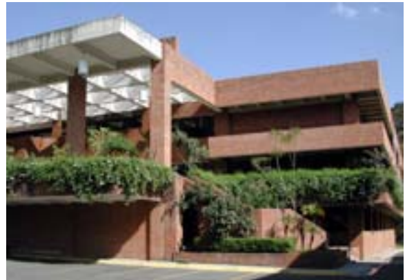
Popol Vuh Museum

This course is unique in that it's an actual professional expedition to do large format digital panoramic photography. Once we photograph this specific area of Guatemala, the course will not likely be repeated.