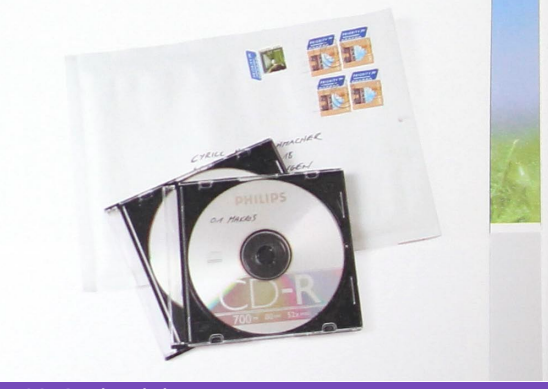
p. 83 CD back home