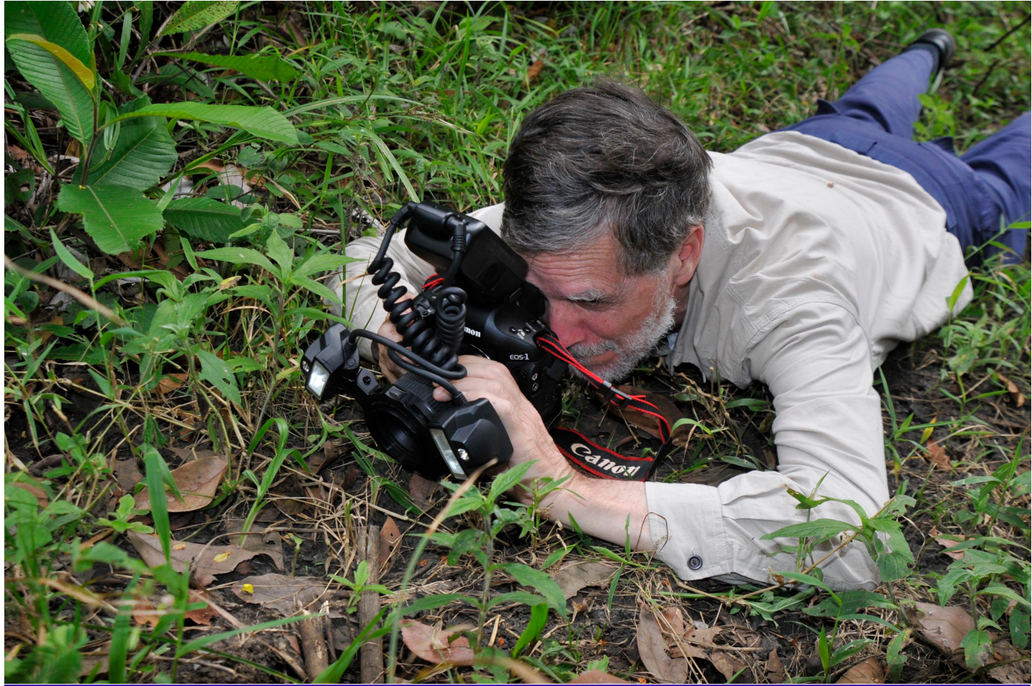
Here is a situation where a beanbag tripod would help, especially one where you can vary the height (so have several sizes with you). Here I am trying to photograph leaf-carrying ants during the few days a year that they cut and carry flowers instead of leaves.

He also mentions a "beanbag tripod." You can buy these commercially, or just fill a cloth bag with dried common beans. Since beans are one of the most common foods in Guatemala, I need to try this again. I must admit that I have not used my beanbag camera support for several decades. I also like his idea for making a flash reflector card yourself but simply cutting a piece of white cardboard.