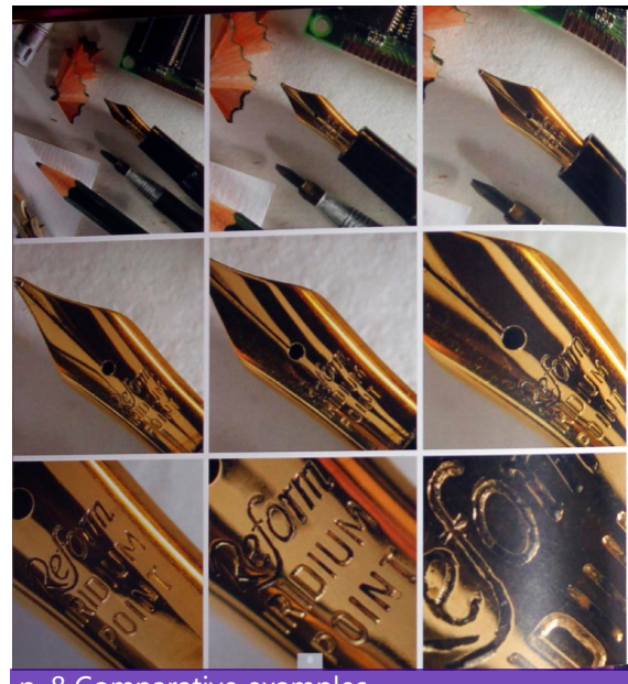
p. 8 Comparative examples