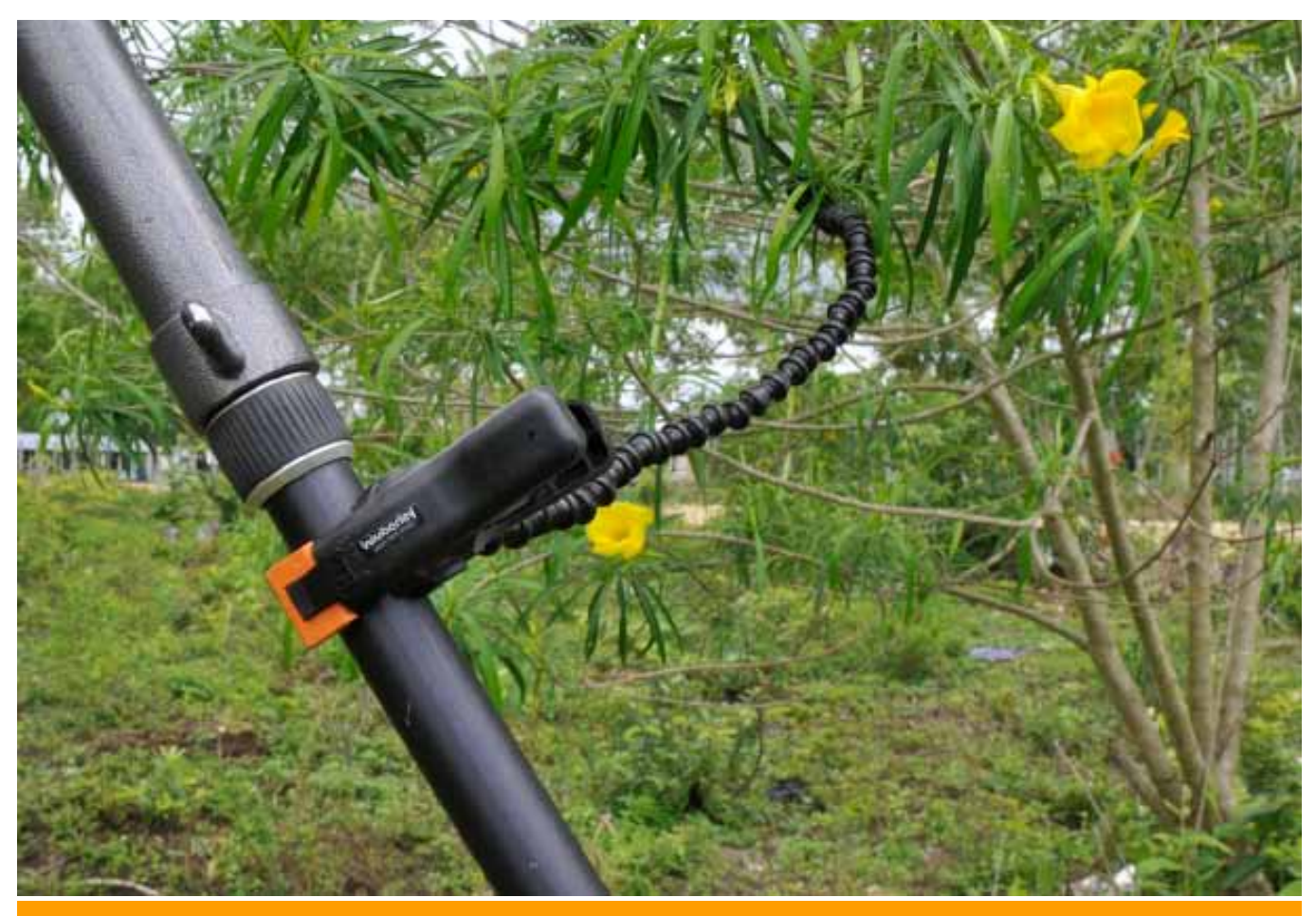
Wimberly plamp + Gitzo G1348 MK2 Mountaineer Inter-Pro Studex tripod. FLAAR Archive 2011.

I have already mentioned the nice Manfrotto 393 gimbel head. It is H shaped (or could be considered U-shaped. I find these inherently more sturdy than L-shaped brackets (sorry, too many L-shaped pano bracket systems wobble).