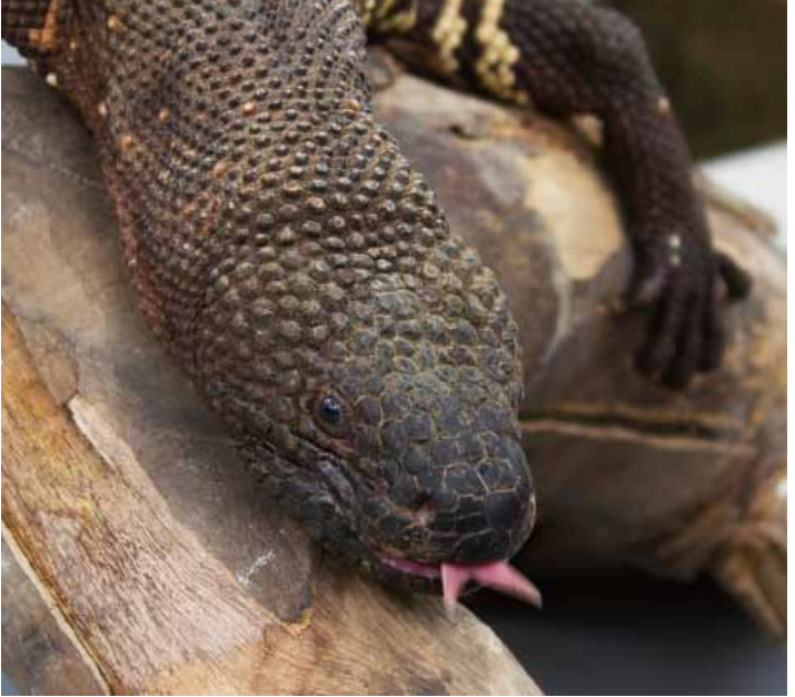
Here are the results of the photography at the Guatemala City "Aurora Zoo" of the venomous Rio Motagua lizard. It helps to have a good tripod to achieve this level of results. Keep in mind, this venmous lizard is not in his cage, it is on an open table directly in front of us. .Zoo La Aurora, Guatemala 2011.