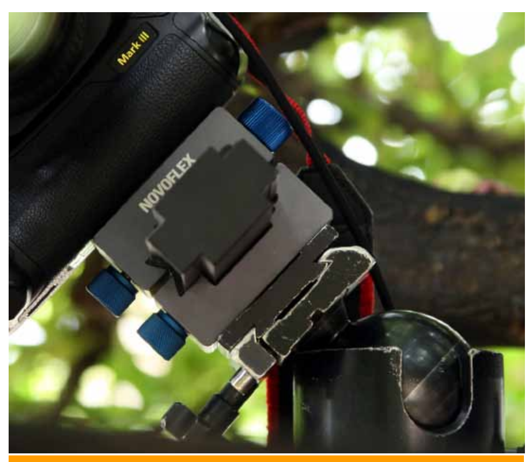
Canon EOS-1Ds Mark III atop a Novoflex focusing rack castel XL rail which is on an aging Arca-Swiss Monoball head, atop a Gitzo tripod.

My favorite pano is definitely the NOVOFLEX. I am writing this page in Milano, Italy, and don't have my NOVOFLEX pano system in front of me to note the model #, but it is the top of their line. FLAAR covers pano heads on other web pages and in PDFs. Link to the other pages and show the mini-titles as hot links.