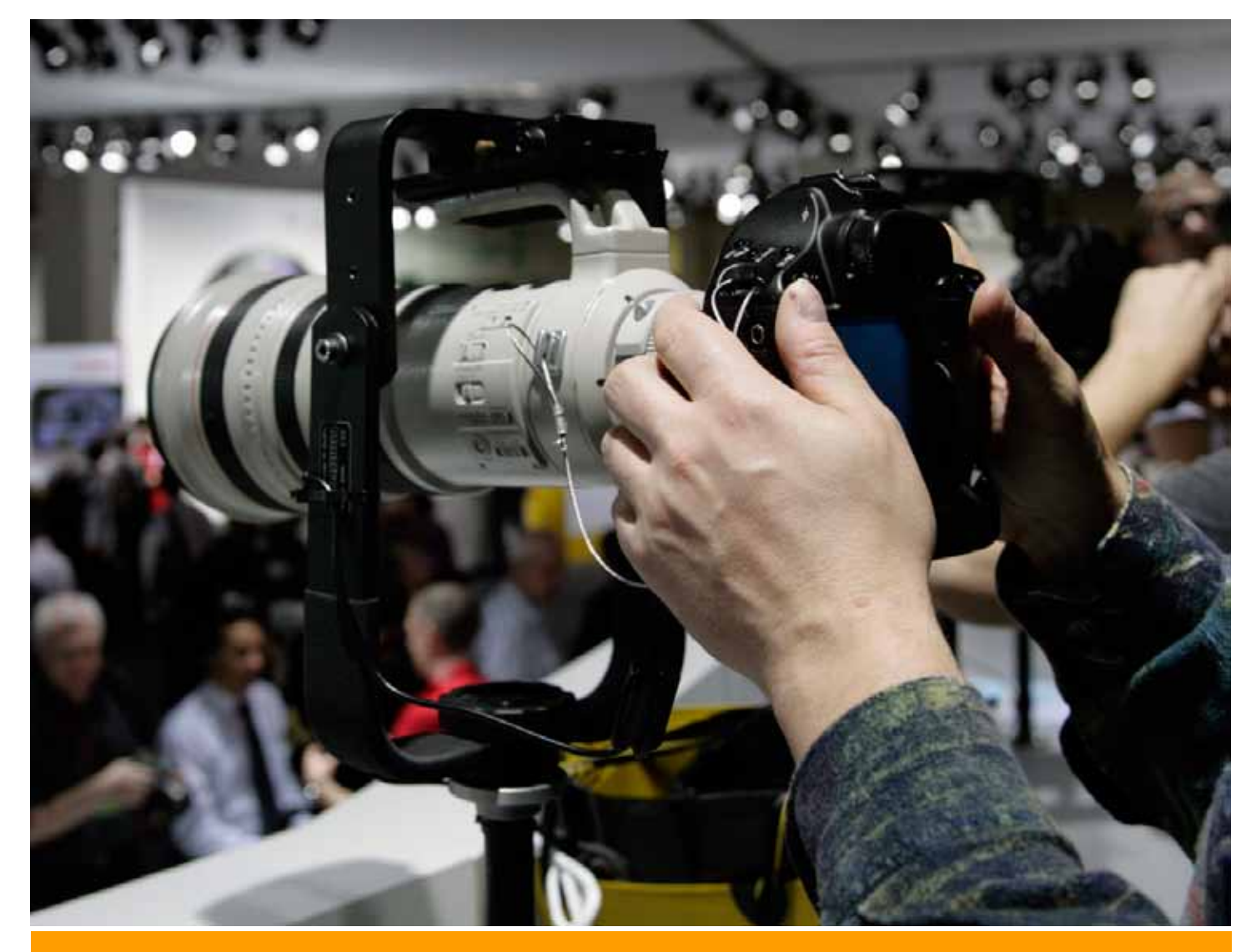
Gimbal heads from Manfrotto at Canon booth. Photokina 2010.