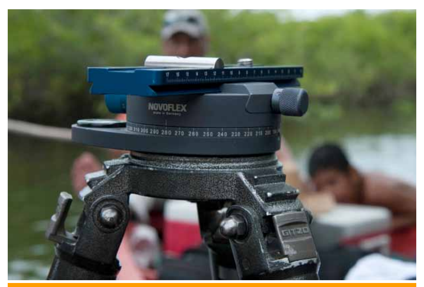
Gitzo G1348 MK2 Mountaineer Inter-Pro Studex tripod + Novoflex Panorama = Q Pro Plate with a Novoflex QPL-Panorama Plate. Mangrove swamp near Monterrico, Guatemala, 100 meters from the Pacific Ocean coast.

Botanists, zoologists, geologists, archaeologists, and architectural historians can also use ball heads from NOVOFLEX out on location.