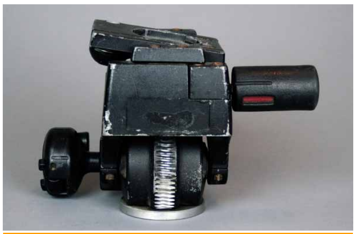
We use this head for medium-format and for large-format cameras. It is best in the studio but as you can tell by the naturally weathered condition, we have been using this head out on field trips to remote areas for years. We liked it so much we obtained a second one.

This geared head has handles which open out. This photograph shows the handles closed. The ability to close the handles is what makes this head so durable over a decade: the handles never get broken off because they can be closed into a protective area.