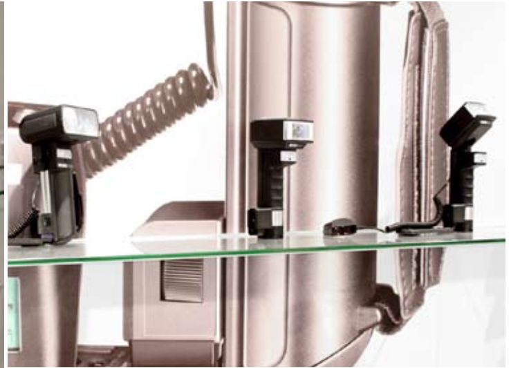
Mecablitz flashes presented at Photokina 2010