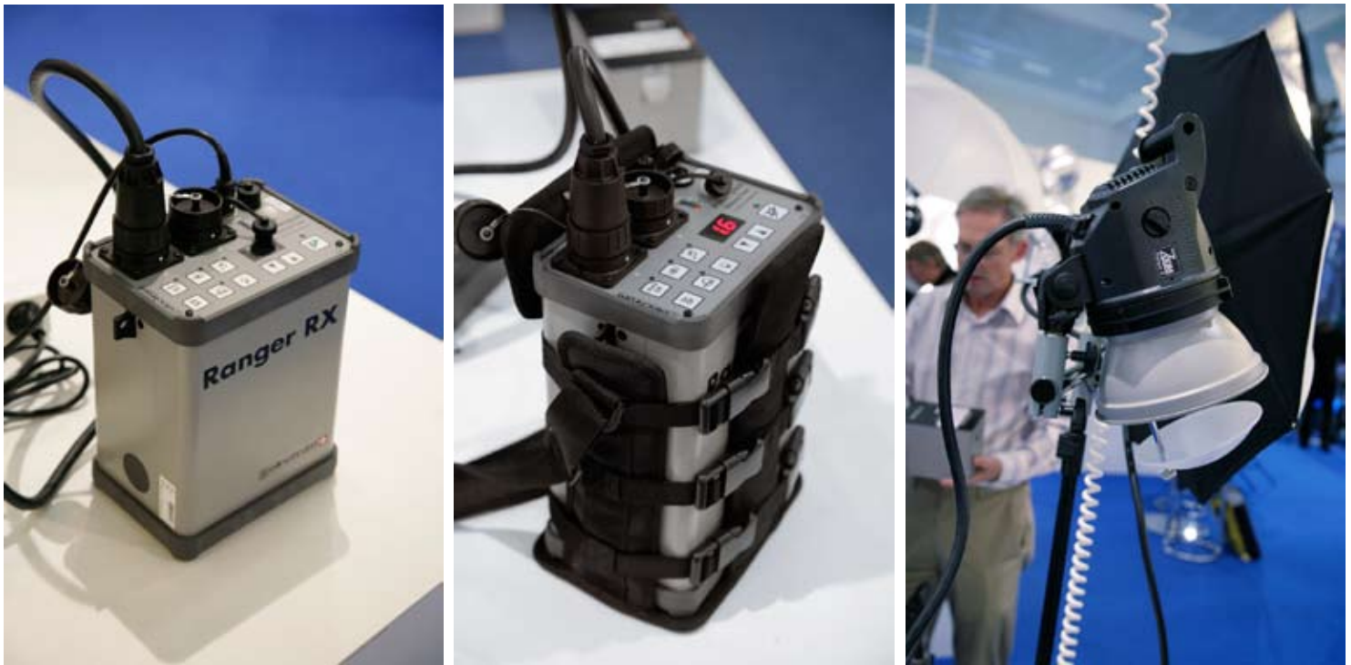
Elinchrom Ranger RX flash system presented at Photokina 2010