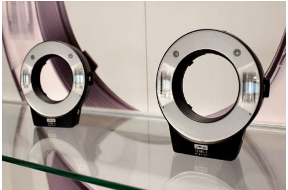
Mecablitz flashes presented at Photokina 2010